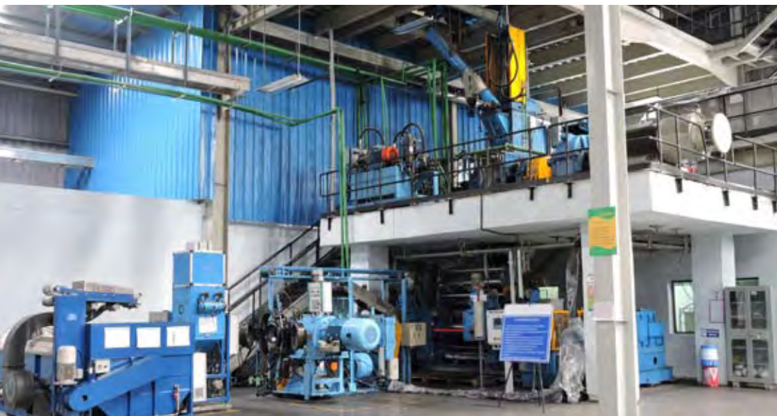
Compounds mixing facility at the Sanand plant

reinforcement), 'solid rubber' products (like windshield weather-strips, backlight weather-strips and glass edge finishers) and 'sponge rubber' products such as outer door seals and control panel seals. Globally SAARGUMMI is working on new products such as coloured profiles, coloured flock, hybrid profiles, cloth applicated profiles and coloured EPDM/TPE, in addition to developing light weight seals.