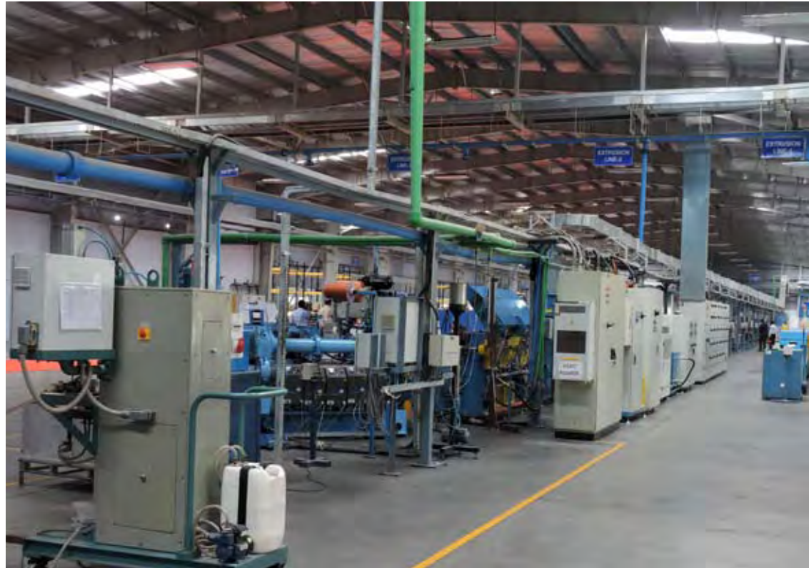
Extrusion line; the company will have five extrusion lines by July this year and the output from the Sanand plant will reach 20,000,000m/year within three years