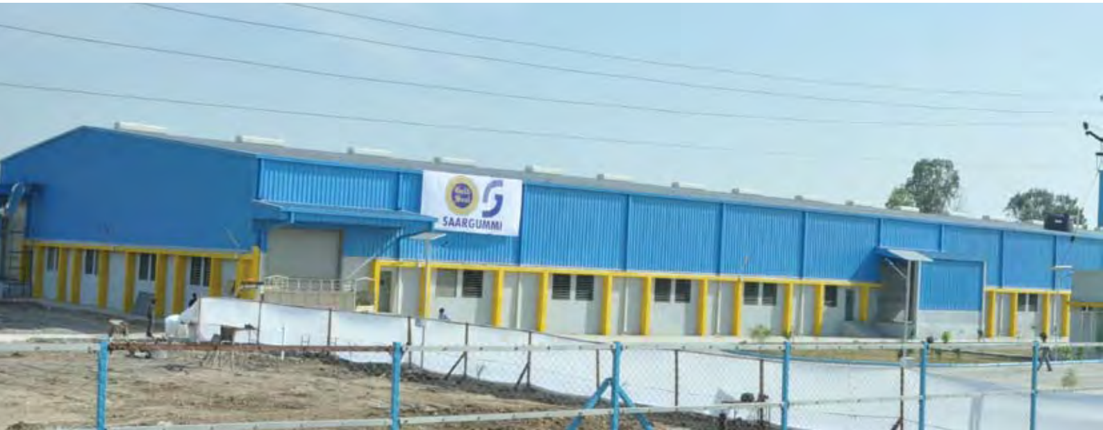
Gold Seal - SAARGUMMI India's new plant in Sanand, Gujarat