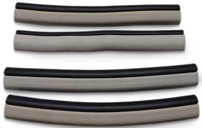
Gold Seal - SAARGUMMI makes several products including EPDM rubber-extruded sealings and weatherstrip profiles. The one shown in the photo is Seal TEX

making India a sourcing hub. Now most of the design and development work is done in Germany. "We have the engineering resources to mix and match and this has given us cost and technological advantages. This was because the customer wants lot of engineering support and the customers are outsourcing designs to their suppliers as they have more experience and understanding of the