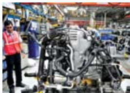
Radiator hoses and sealing systems on the made-in-Chennai Ford EcoSport are Gold Seal products.