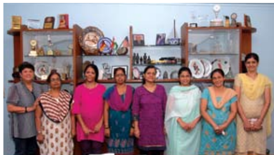
Eighty percent of the workforce at Gold Seal's Mumbai plant comprise women, who've been there for over 2 decades.

which is as key as other changes, in Darius' words.