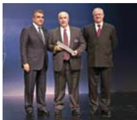
Chongqing Light Industry & Textile Holding Group (CQLT SaarGummi) has recently bagged a supplier award from Volkswagen AG.

From its origins as a family-run business, Gold Seal has been able to tap global opportunities as a result of the JVs it signed and slowly but surely brought about fundamental changes in its way of working. This technology has been manifested in its state-of-the-art Daman plant and Mumbai in terms of training, new equipment and a change in mindset,